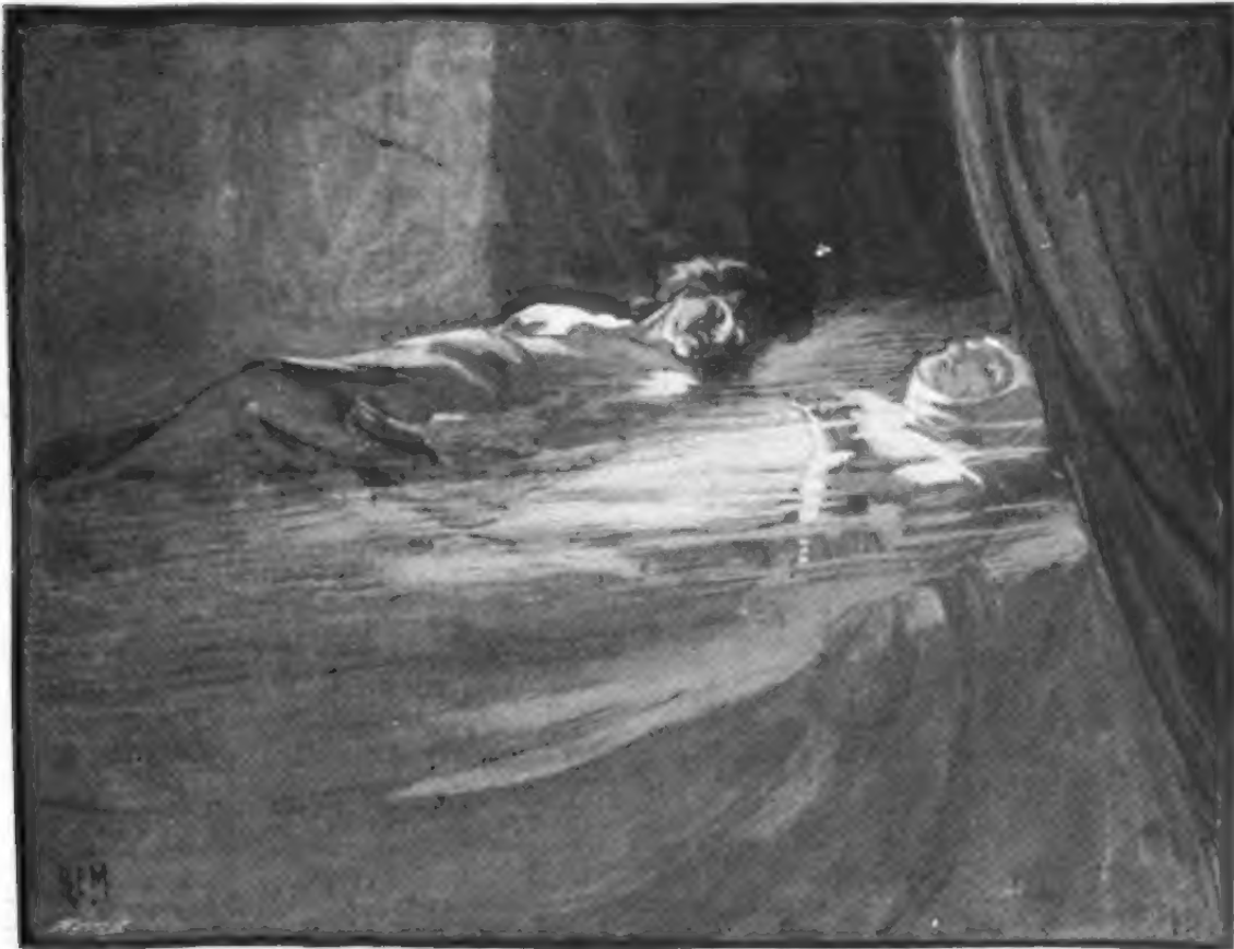
The figure which met my sight was that of a woman prepared for burial.

"The first thing that met my eyes in the